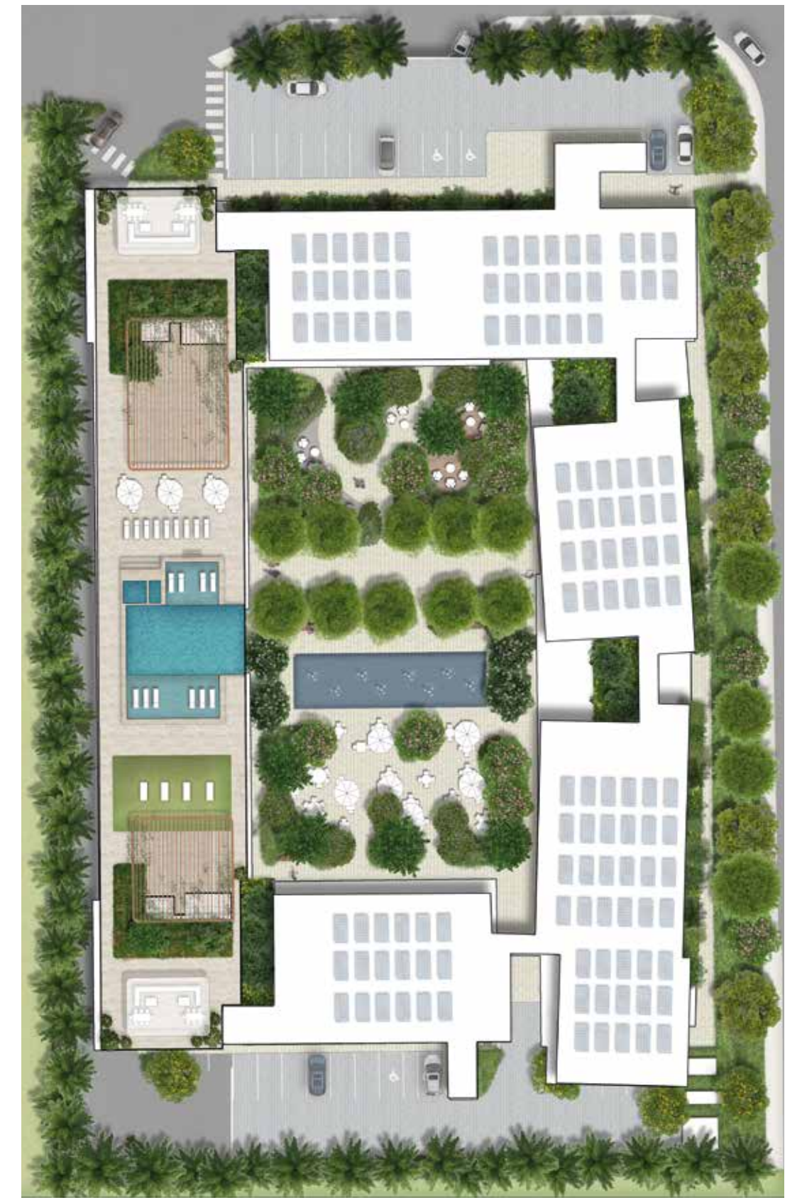
The Grove Too | Site Plan